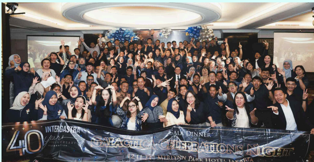
40th Years celebration of PT Intergastra Nusantara

PT. VISI TRADING DISTRIBUSI was established in Jakarta on September 26, 2011, as a subsidiary of P.T. INTERGASTRA Nusantara. The company specializes in providing comprehensive systems and solutions for hospitals, including laundry and sterilization, while also expanding into diverse technological innovation tailored to meet customer needs. PT. VISI TRADING DISTRIBUSI has expanded its reach nationwide, continuously enhancing its expertise.