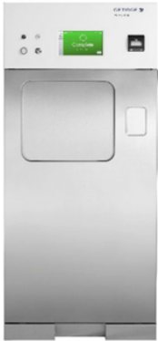
Getinge Poladus 150 VH2O2 Sterilizer