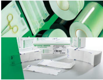
Sterilizing Pouches & Rolls